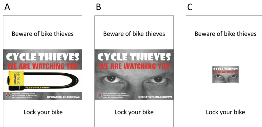
Figure 1 Leaflets used in the experiments. Note that the leaflets were printed in black and white in experiment 1 and colour in experiment 2. (A) The control condition of both experiments. (B) The eyes condition of experiment 1/large eyes condition of experiment 2. (C) The small eyes condition used in experiment 2 only.

participants were observed in a public place, and were not individually identified or approached during the course of the experiment, it was not required or appropriate to obtain informed consent or conduct debriefing.