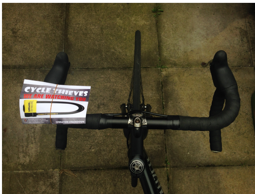
Figure 2 Illustration of the position of a leaflet on bicycle handlebars.

and attached to one end of the handle-bars of bicycles at the rack using an elastic band (Fig. 2). The position was intended to make it difficult for the cyclist to leave with their bicycle without first removing the leaflet.